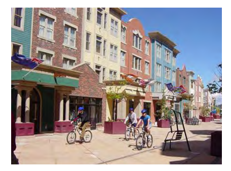
Examples of Mixed-Use Centers

Transitional Mixed-Use occurs along corridors and between centers and residential neighborhoods.