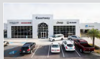
Courtesy Chrysler Dodge Jeep Ram Breaux Bridge