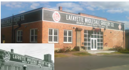
Top: Lafayette Wholesale Grocery Warehouse Inset: 1940s

PZD personnel changes in 2015 included Kelia Bingham hired as planner I in the Planning