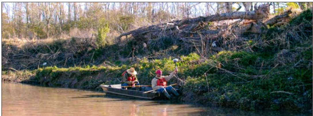
Public Works engineering survey crew

Traffic Calming: http://www.lafayettela.gov/TrafficAndTransportation/Pages/Traffic-Calming.aspx