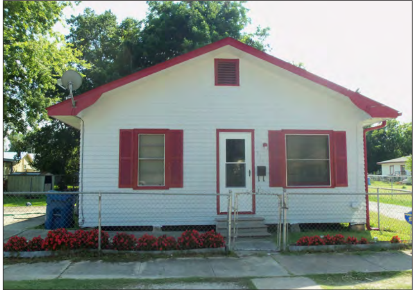
Completed Neighborhood Pride project

Challenges facing the department in the coming year are primarily related to funding decreases and the escalating cost of housing rehabilitation, staffing at Lafayette Science Museum and meeting client demand for housing counseling services.