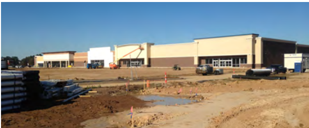
Costco construction site