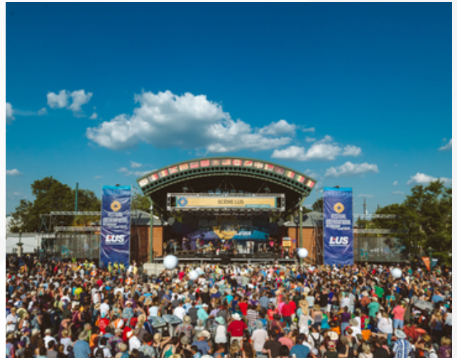
Festival Internationale de Louisiane, Downtown Lafayette