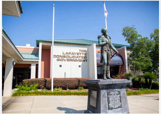
Lafayette Consolidated Government, City Hall