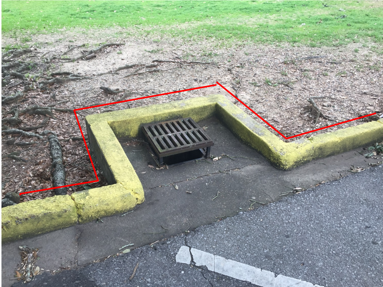
Parking lot drain; with curbing; near parking spaces